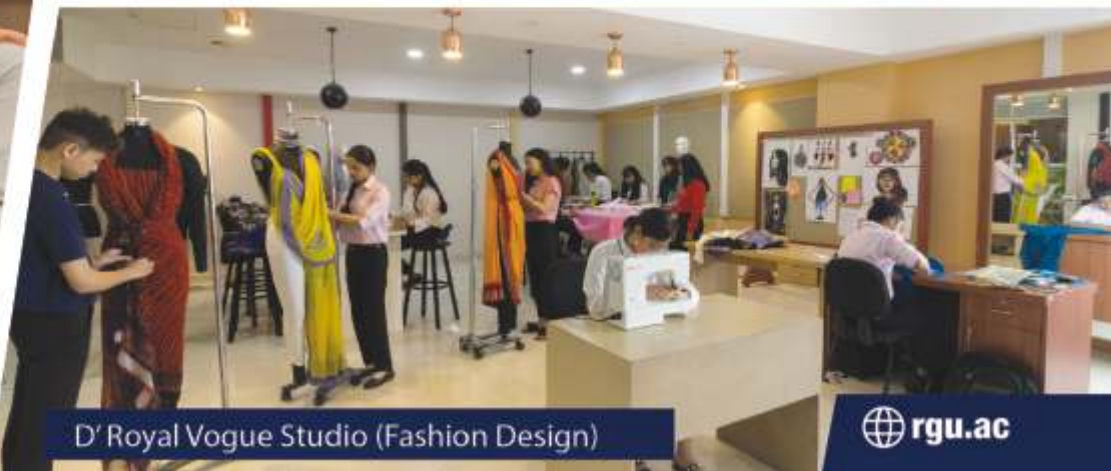
D' Royal Vogue Studio (Fashion Design)