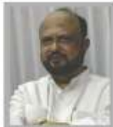
PRAFULLA KUMAR MAHANTA