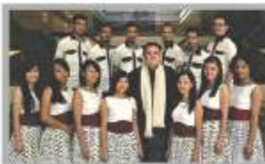
SHILLONG CHAMBER CHOIR