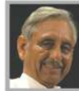
MANISH SHANKAR AIYAR