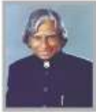
DR. APJ ABDUL KALAM