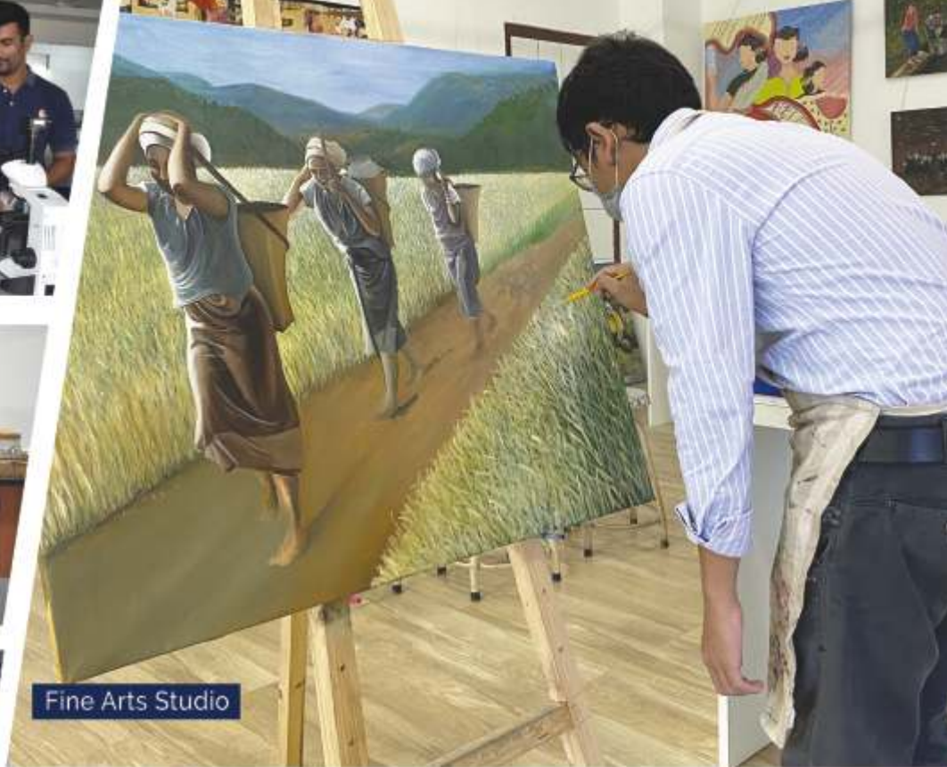
Fine Arts Studio