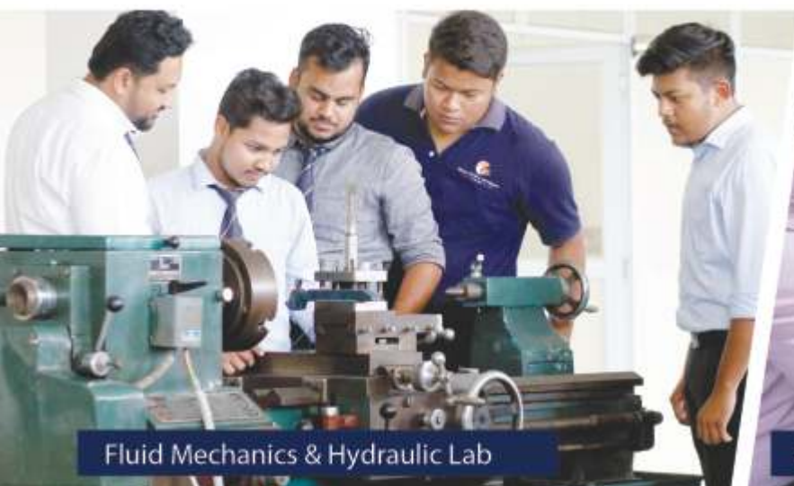
Fluid Mechanics & Hydraulic Lab