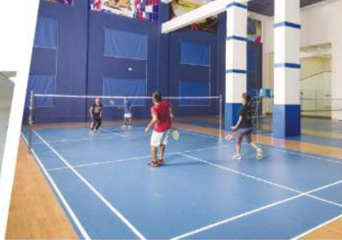
SPORTS & GAMES FACILITY

WELL-MAINTAINED SPACES & FACILITIES | WELL-EQUIPPED WITH SPORTS LOGISTICS