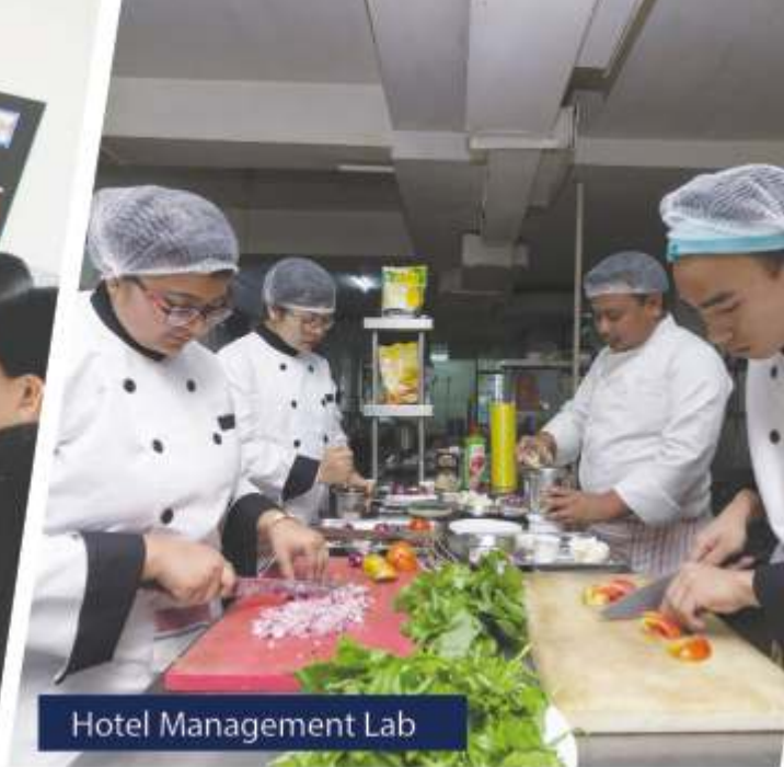
Hotel Management Lab