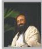
SRI SRI RAVI SHANKAR