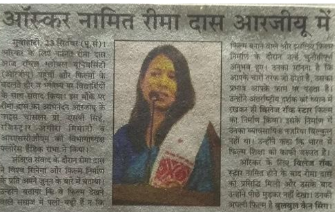
DAINIK PURVODAY 24 th SEPTEMBER PAGE 3