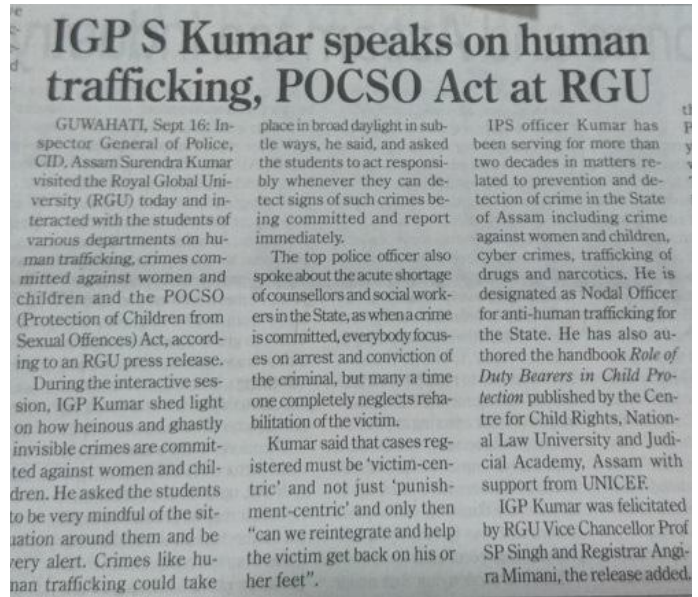
THE ASSAM TRIBUNE 17 th SEPTEMBER 2019 PAGE 5