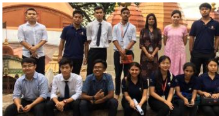
9 th September - A site visit for visual inspection of Namatkali Temple, Guwahati.