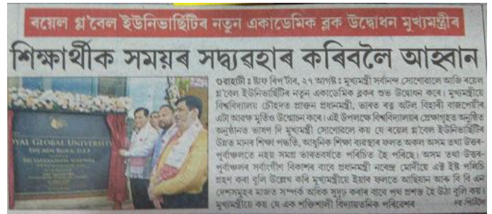
DAINIK JANAMBHUMI 28 th AUGUST 2019 PAGE 3