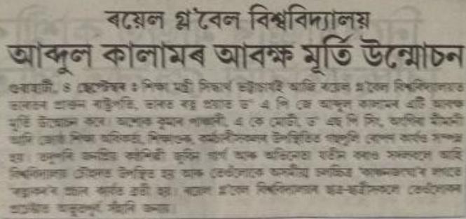
AXOMIYA PRATIDIN 5 th SEPTEMBER 2019 PAGE 12