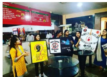
10 th September - Department of Psychology, observed ‘World Suicide Prevention Day’.