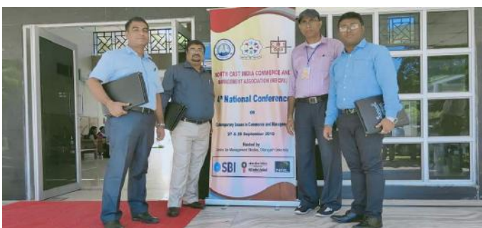
27 th - 28 th September- Faculty members attending the National Seminar on 'Contemporary issues in Commerce and Management at Centre for Management Studies, Dibrugarh University.