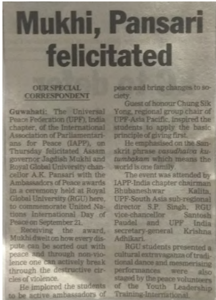
THE TELEGRAPH 27 th SEPTEMBER PAGE 3