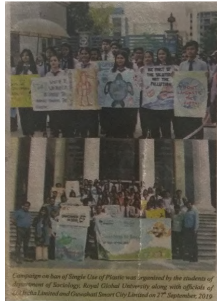
THE SENTINEL 28 th SEPTEMBER PAGE 14