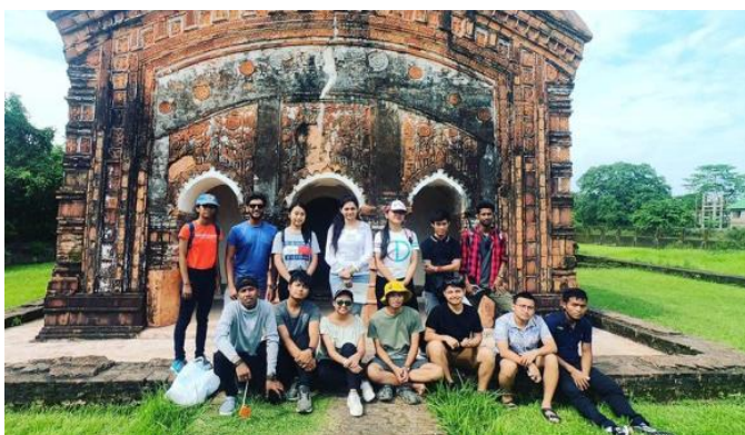
14 th -17 th September – Students of 5th Sem did a detailed Architectural Documentation of Ghanashyam’s House, Joysagar.