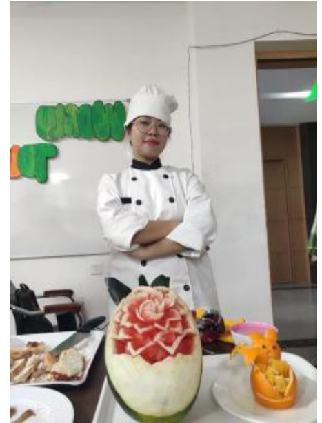
27 th September - World Tourism Day