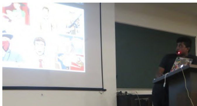
14 th September - TensorFlow All Around workshop was held to make the developers in the field of Machine Learning community, learn the library TensorFlow, from experts.