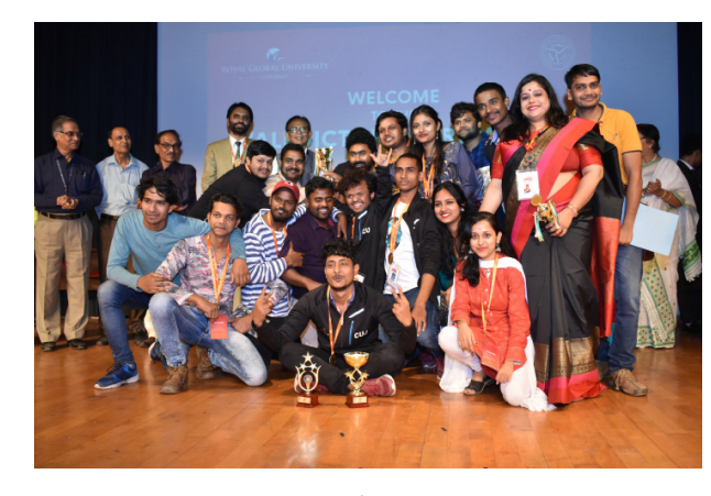
Photograph\ of\ CUJ\ contingent