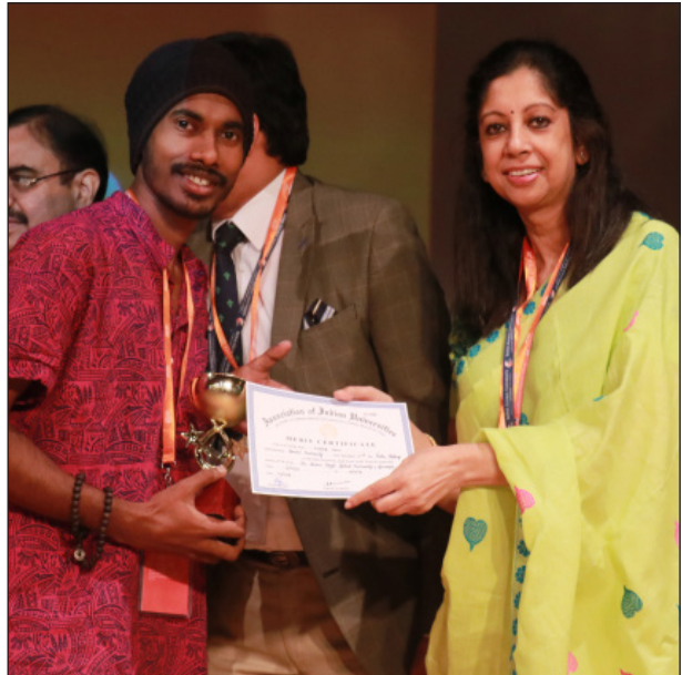
Registrar handing over award to a participant