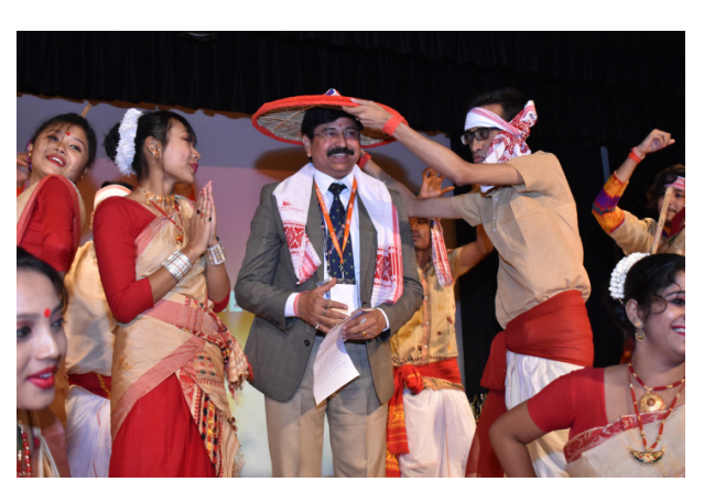
Felicitation of Vice-Chancellor