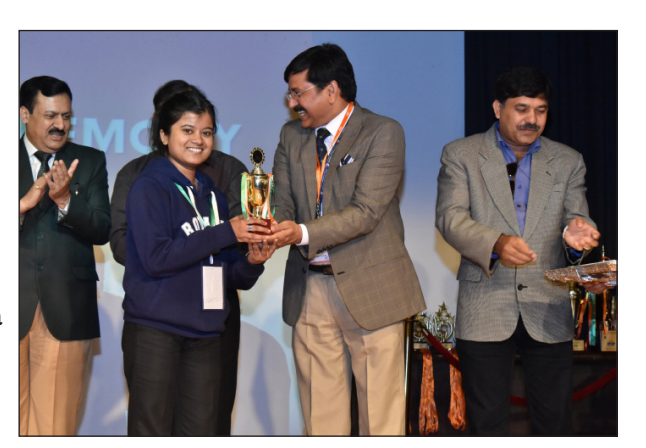
Royal\ Student\ receiving\ award\ from\ Vice-Chancellor