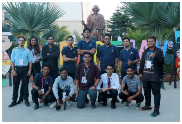
Karmotsav Newsletter Photography Team