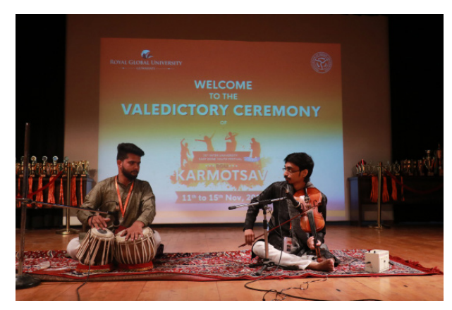
Participants from BHU