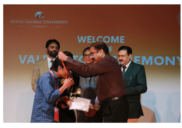
Chancellor awarding the winner