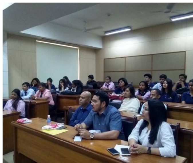
The Advertising Club, Guwahati, conducting a session with the students of MBA and Royal School of Communications & Media on 16th March, 2018.