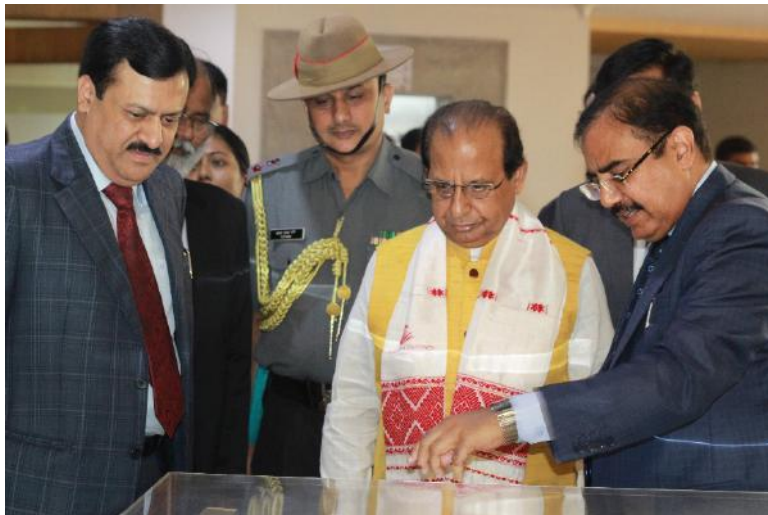
His Excellency, Prof. Jagdish Mukhi, Hon'ble Governor of Assam visited the campus on 25th October, 2017