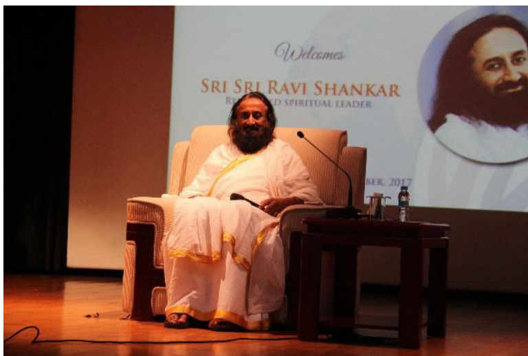
Sri Sri Ravi Shankar, 6th September, 2017