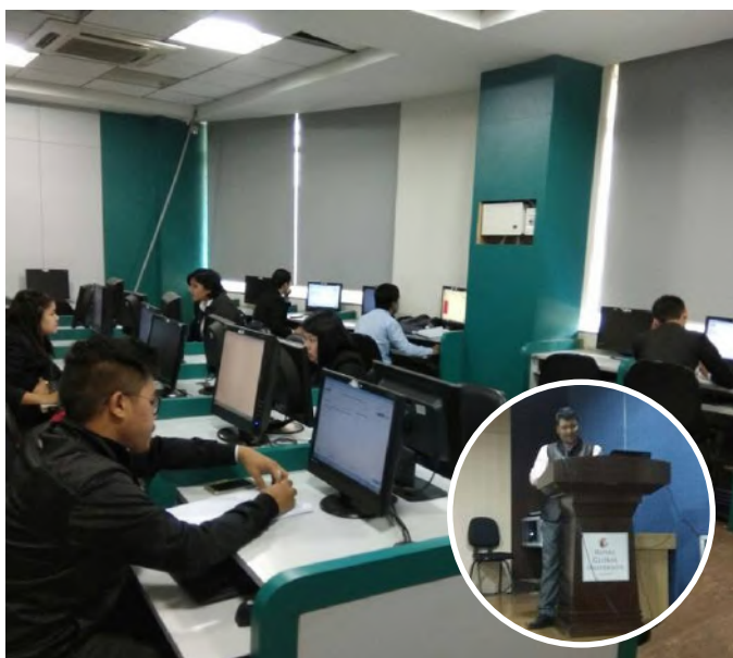
Campus drive by Kotak Life Insurance for MBA students of Royal School of Business on 19th January, 2018.