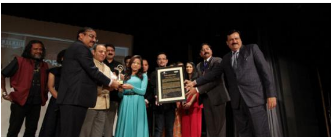
Shillong Chamber Choir, 22nd February 2018