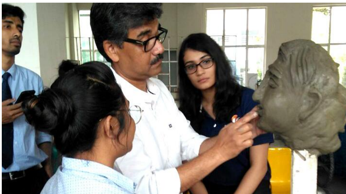
Sculpture Workshop: 19th & 20th March, 2018