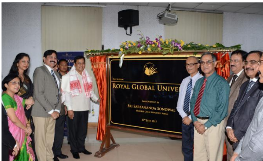
Inauguration of The Assam Royal Global University, 26th July, 2017. Sri Sarbananda Sonowal, Chief Minister, Assam, unveiled The Assam Royal Global University plaque.

Established in July 2009 as Royal Group of Institutions, which has now been merged into The Assam Royal Global University, the University is located near Tirupati Balaji Temple on National Highway and spans across 37,000 square meter [4 lakh square feet] of built-up centrally air-conditioned structures.