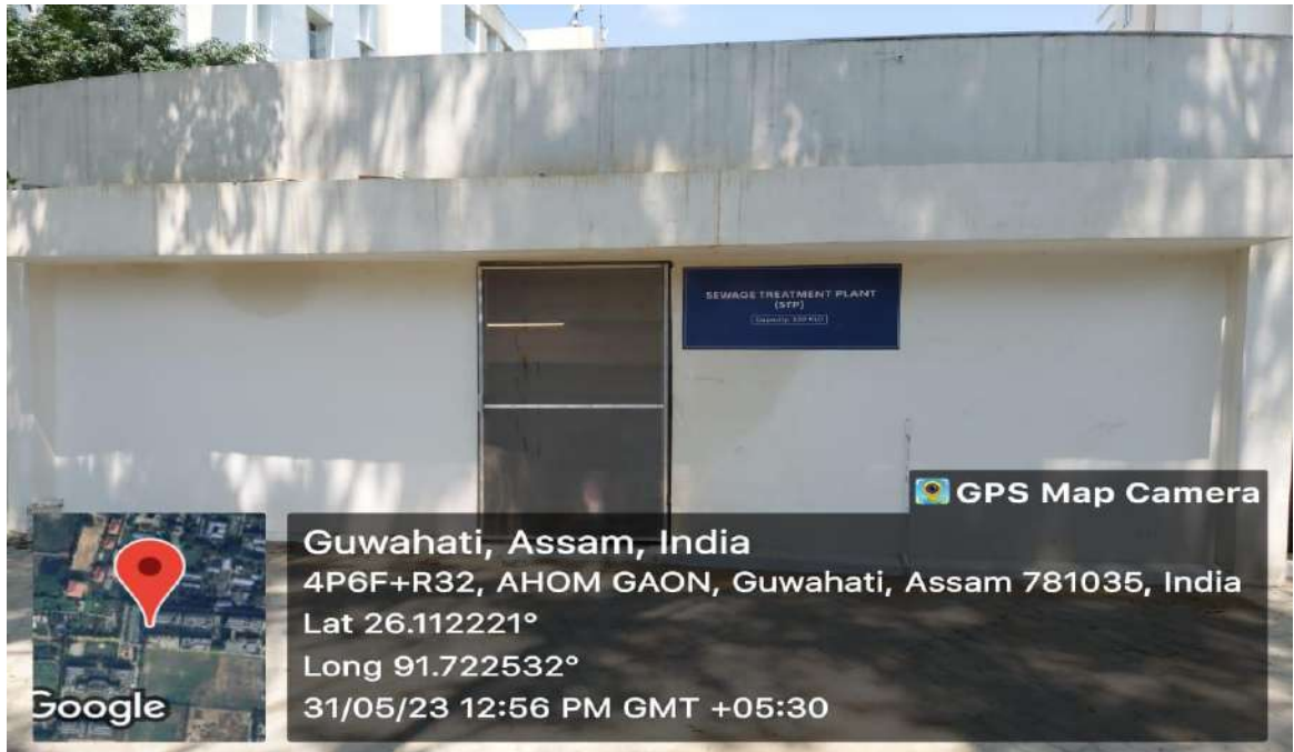
Sewage Treatment Plant is installed behind Amphitheatre

The University has a Sewage Treatment Plant (STP) to effectively treat liquid waste. The recycled water is utilized for various purposes such as gardening, flushing toilets etc.