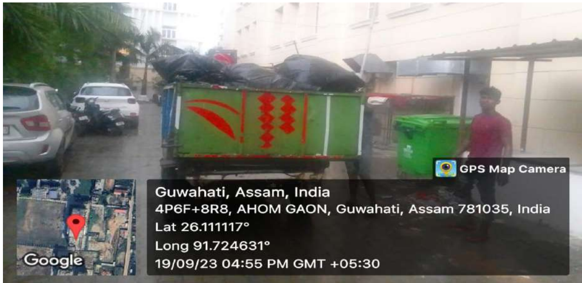
Collection of solid waste