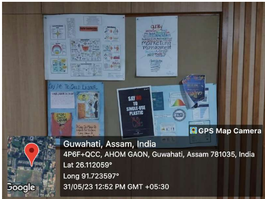
Awareness on Ban on single-use plastic University Notice Boards