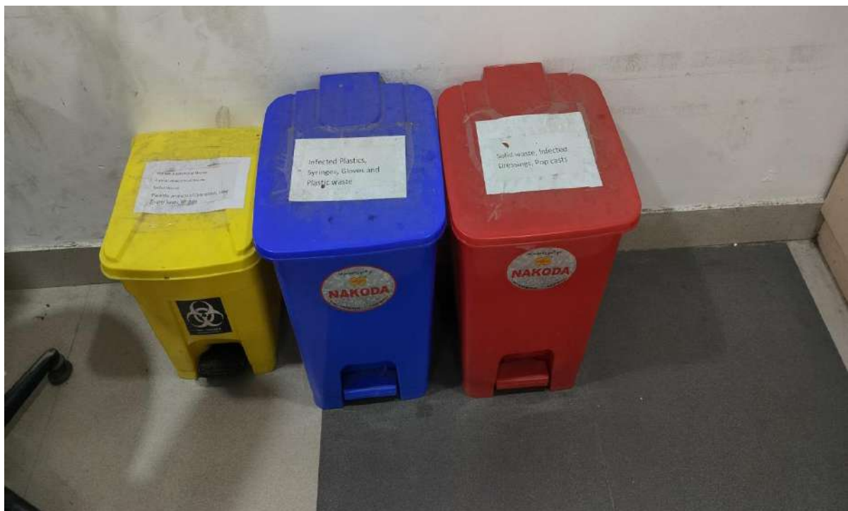
Colour coded bins for biomedical waste