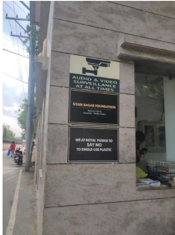
Say No to Single Use Plastic signage at the entrance of the University

Single use plastic items such as plastic bottles, bags, spoons, straws and cups are banned completely and awareness is created among students and staff of University.