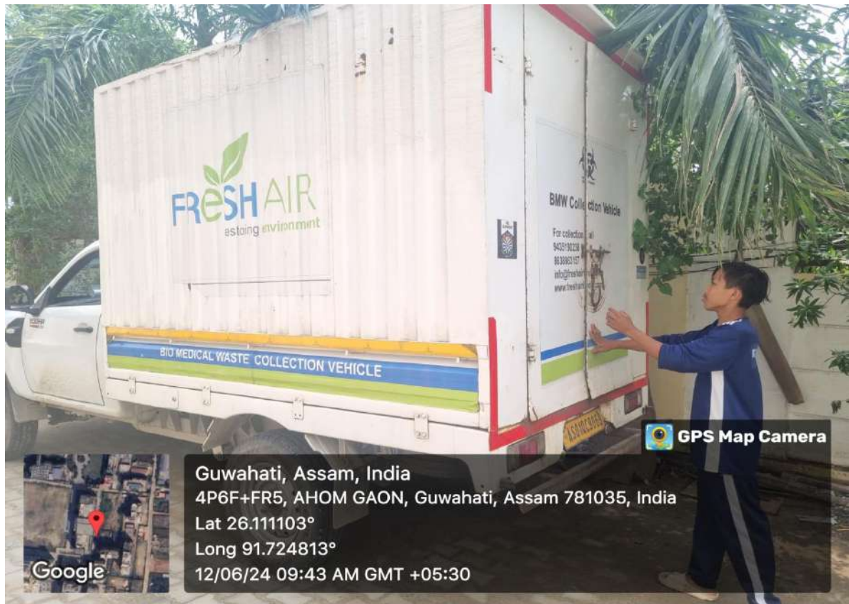
Biomedical waste collected for disposal

The University has signed an MoU with Fresh Air Waste Management Services Pvt Ltd., Guwahati for the treatment of biomedical waste. The waste is segregated in colour coded waste bins and label system.